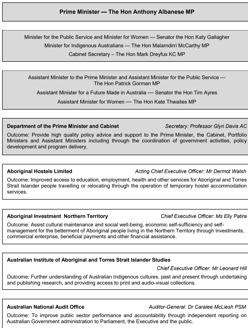
Figure 1: Prime Minister and Cabinet portfolio structure and outcomes