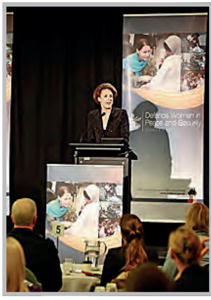
Minister Assisting the Prime Minister for Women, Senator the Hon Michelia Cash, speaking at the 2014 Chief of Defence Force's Defence Women in Peace and Security Conference, 16–17 June 2014.

An example of a recent education event is the 2014 Chief of Defence Force's Defence Women in Peace and Security Conference which was held in Canberra on 16–17 June 2014. The focus of the conference was Women, Peace and Security and the implementation of the National Action Plan, and experiences of women in peace operations. The Minister Assisting the Prime Minister for Women spoke at the conference about Australia's commitment to the Women, Peace and Security agenda and the importance of women's engagement in peace and security processes.