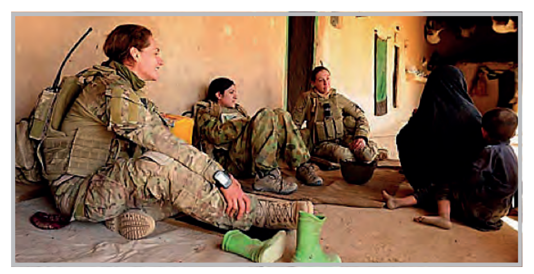
A Female Engagement Team from Mentoring Task Force-Three speak with women in the Karmisan Valley, Afghanistan.