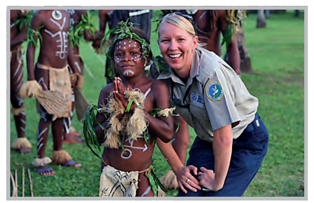
AFP Member of the Pacific Participating Police Force, RAMSI.

Supporting the RSIPF to participate in the World Vision Channels of Hope Project. The project uses community and faith leaders to interpret biblical passages to discredit some of the origins of beliefs surrounding domestic violence. The Channels of Hope Project recently delivered training to RSIPF officers so they can undertake workshops aimed at reducing gender-based violence within communities.