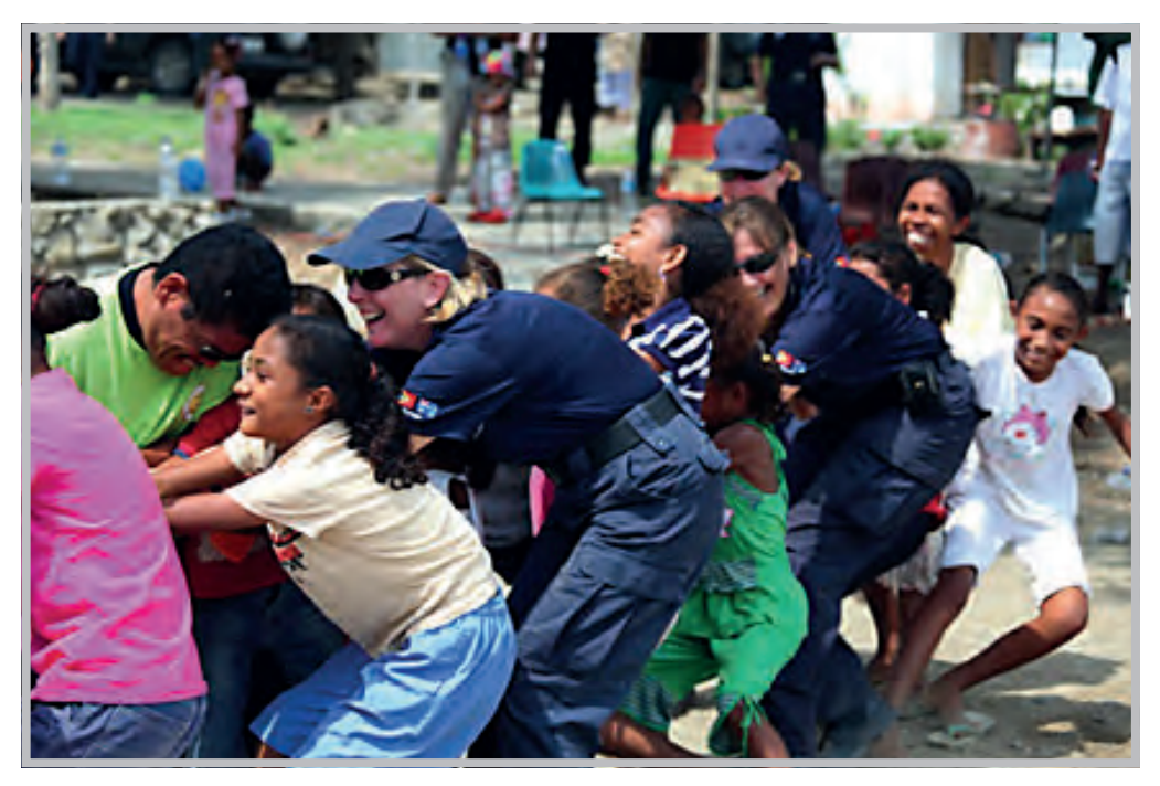
AFP and community members participate in a tug of war in Timor-Leste.

Tonga Police Development Programme (TPDP) (Trilateral programme between the Tonga Police Service, AFP and New Zealand Police) — Under the TPDP, the AFP supports the Tonga Police Women's Advisory Network by facilitating attendance at regional meetings. The AFP assisted the Domestic Violence Crisis Centres to host a conference, which brought together stakeholders from the community, church groups, non-government organisations, government agencies and police to discuss approaches to and initiatives for combating violence against women and children. As a result of that conference a police woman has been seconded to each of the two crisis centres to facilitate the reporting of domestic violence incidents. The TPDP continues to support and fund an annual women's conference.